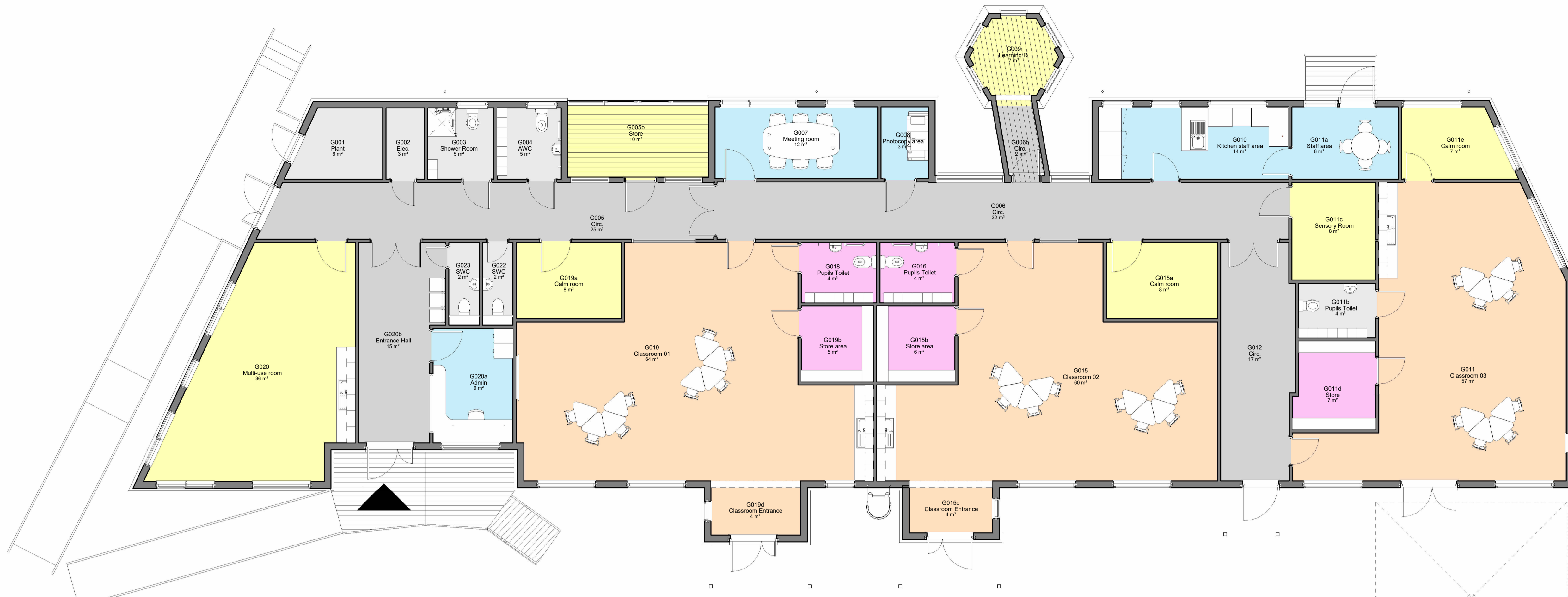
1 Proposed Ground Floor - Occupancy 1:75